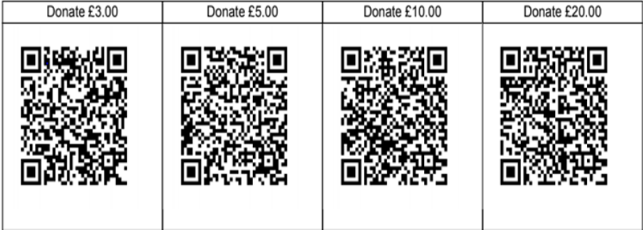
Donate without Giftaid-it

Please treat as gift aid donation, all qualifying gifts of money made from the date of this declaration. I am a UK taxpayer and understand that, if I pay less Income Tax and/or Capital Gains Tax in the current year than the amount of Gift Aid claimed on all my donations, it is my responsibility to pay any difference.