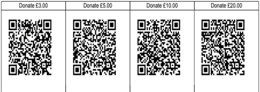
Donate without Giftaid-it

Please treat as gift aid donation, all qualifying gifts of money made from the date of this declaration. I am a UK taxpayer and understand that, if I pay less Income Tax and/or Capital Gains Tax in the current year than the amount of Gift Aid claimed on all my donations, it is my responsibility to pay any difference.