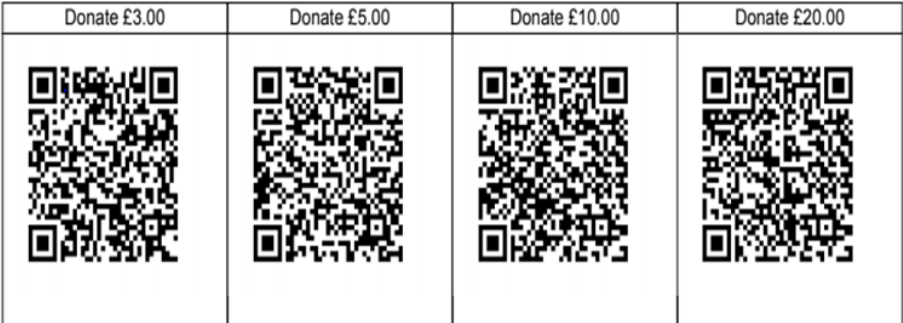
Donate without Giftaid-it

Please treat as gift aid donation, all qualifying gifts of money made from the date of this declaration. I am a UK taxpayer and understand that, if I pay less Income Tax and/or Capital Gains Tax in the current year than the amount of Gift Aid claimed on all my donations, it is my responsibility to pay any difference.